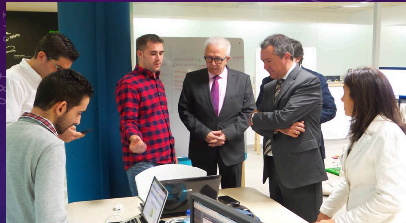
Real world connections