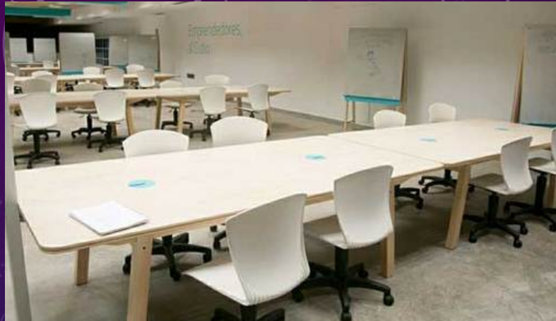
The Crowdfunding El Cubo